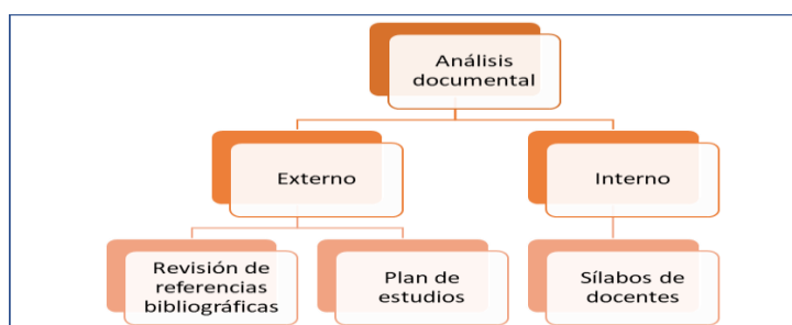
Figure 3. Documentary analysis of the applied formative research.

For the application of data collection regarding the applicability of formative research in the curriculum, the following methodology was used, considering the strategic indicators shown in Figure 4.